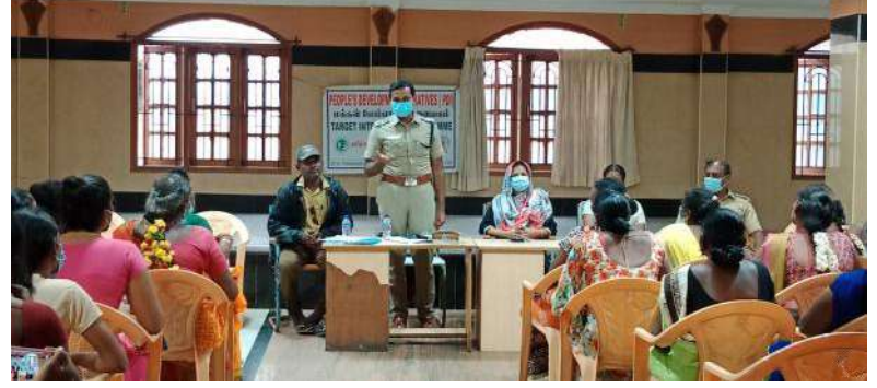
Advocacy Meeting with Police Personnel, Samayapuram, Tiruchy

On 14th Mar. 2022, an advocacy meeting was conducted with auto drivers, brokers and Jamath leaders at Government Hospital, Thuraiyur. Twenty-five secondary stakeholders including lodge boys, auto drivers, and Jamath leaders. The transgender community shared their difficulties they face with common public and request the secondary stakeholders to support them.