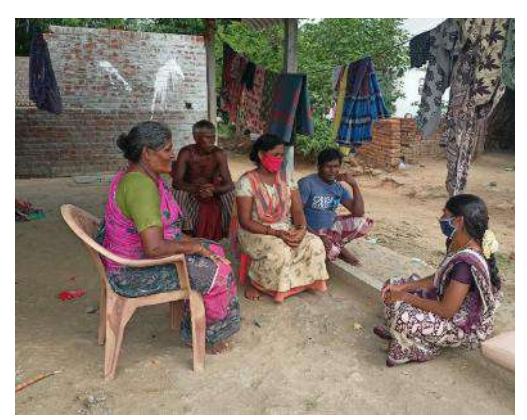
Discussion to stop the son preference with ANC's Family Members