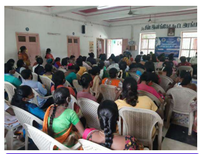
Community Event 2021

The activity of mobilizing community members together assumes importance, as the unified community will sustain the programme activities even after the withdrawal of the programme. The community events provide platforms for the community members to come together, spending time in a common place.