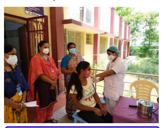
Ammapettai Primary Health Centre