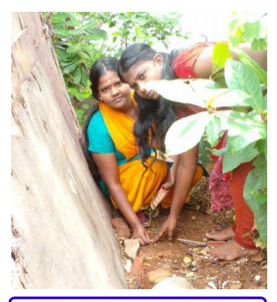
Planting Tree Sapling by YS members, Indra Nagar

On 5th June, the YS Clubs of Kollangulam, Indra Nagar, and Kalnayakkan Street, Panju Kidangu Street, and Burma colony celebrated International Environment Day. They used