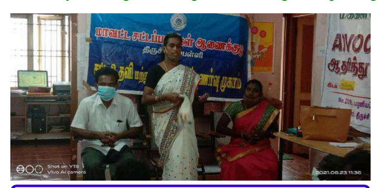
Advocacy Meeting is in Progress

The core group population is being influenced by different stakeholders including Jamath leaders, auto drivers, pimps, and lodge boys. They are the vital stakeholders of the project who are responsible for the effective implementation of targeted intervention programmes for the core group population. These secondary stakeholders have a greater role in creating an enabling environment and are held responsible for the effective implementation of the programme. The project organized advocacy meeting with the brokers and Jamath leaders to help the staff for mobilizing FSW, MSMs, and Transgender. The other stakeholders including auto drivers, lodge boys, and pimps are also invited to the stakeholders meeting to be oriented on the different programme activities and its intended objectives. The stakeholder meetings give them a clear picture on programme activities and help the project team to persuade their support. Three such advocacy meetings were organised during the reporting period.