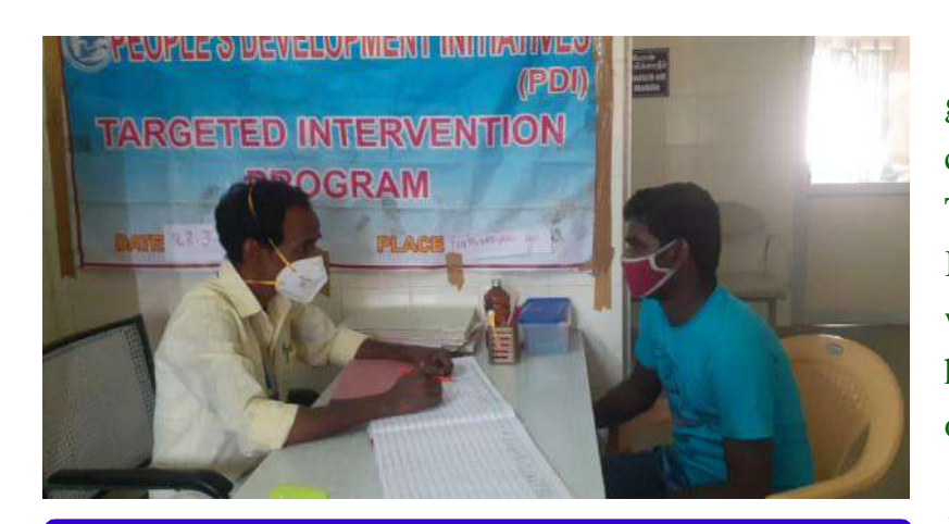
Health Camp is in progress, Thiruvaiyaru Government Hospital

The project had organised general health camps for the community members in Thanjavur, Thiruvaiyaru, Orathanadu, and Kumbakonam. All the health camps were held in the government hospitals. The health camps were organised from 25th to 27th August 2021. In total, one hundred-fifty community members were screened for general health.