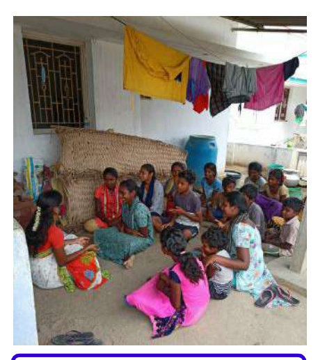
Adolescent Girls in the Life Skills Class

In order to sensitize the youth population who hail from the target blocks on gender issues and to enhance their life skills, the life skills education programme is being organised at the village level. Trained staff conducted life skills education to 814 adolescents from the villages of the four blocks. Among them, 394 were boys and 420 were girls. The adolescent in the age group of thirteen to twenty were motivated to attend the training. Gender issues were also included in the life skills programme and the adolescents were sensitized on key gender issues. The programme is conducted during the evening hours for two days and lasts for 4 hours.