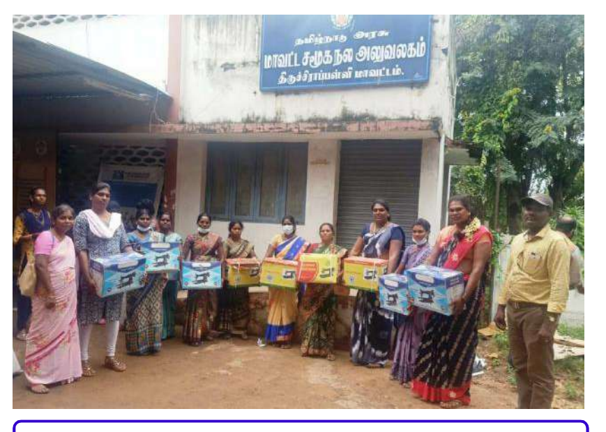
Happy Smiles with New Sewing Machines

The community members were assisted by the project team to get various welfare measures from the government. During the reporting period, 47 have obtained ration cards, 15 members got transgender welfare board membership card, 8 got certificates from revenue department, seven got their Adhaar cards, and twenty have got PAN cards. Two eligible