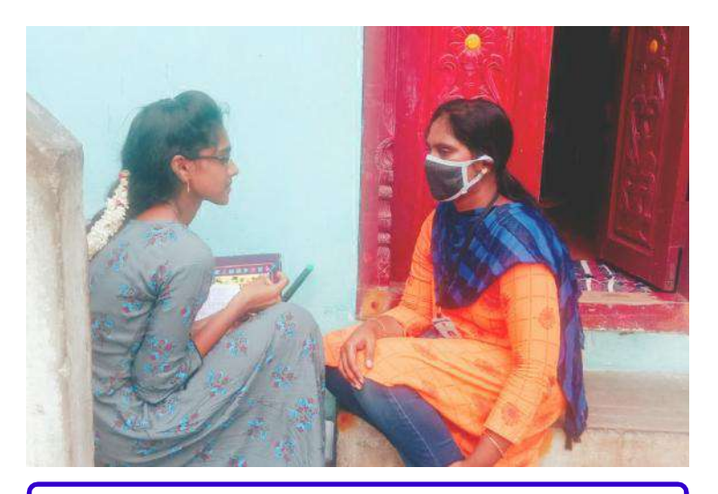
Career Counseling is in progress

It is understood and observed from the study conducted earlier by PDI with the support of IIHS that the sanitation workers need counselling services for various aspects. During the programme implementation and interactions with the sanitation workers, the Community Development Workers identified the sanitation workers who need counselling services. They referred them to the project counselors to counsel the interacted