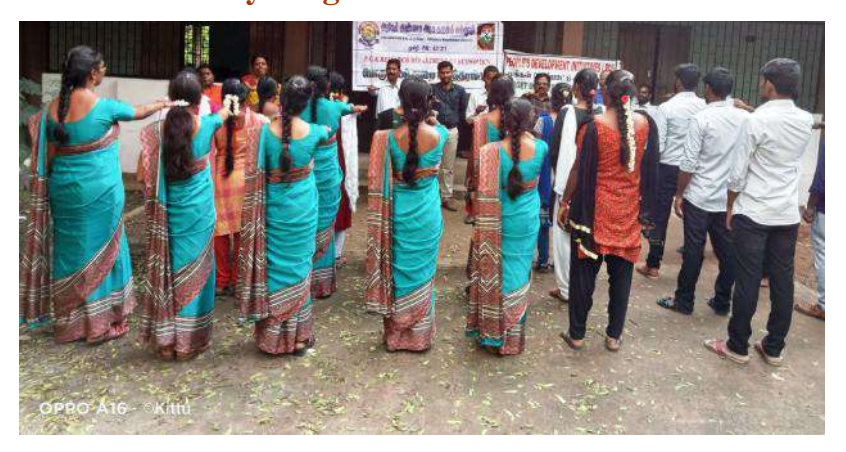
World AIDS Day - Oath Taking at Musiri

On 1st Dec. 2021, the project commemorated World AIDS Day programme at Aringar Anna Government Arts College, Musiri. Students from Department Social Work were oriented on HIV/AIDS and they promised that they will also spread the information to other students and at the village level also. The programme was over with oath