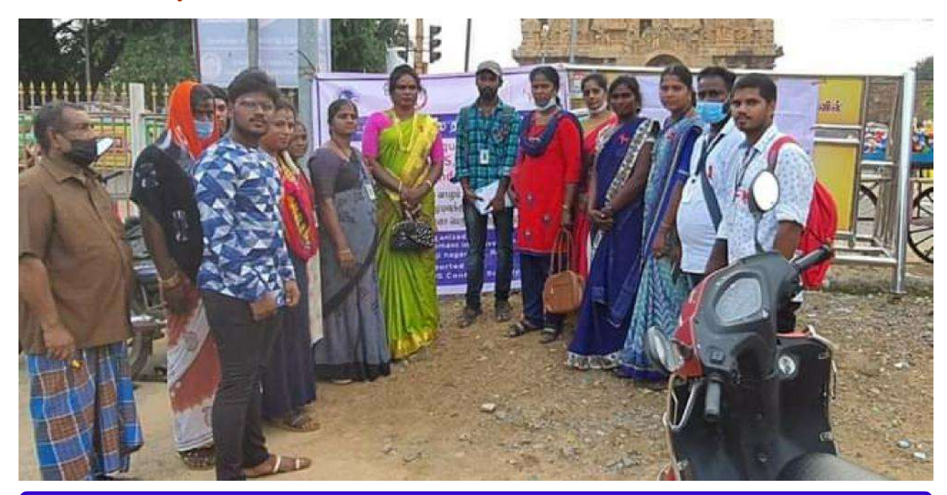
World AIDS Day Programme at the Parking Stand of Peria Kovil, Thanjavur

The World AIDS Day was observed on 1st December 2021 at the entrance and parking area of the Peria Kovil, Thanjavur where IEC materials were distributed to the common public who visited the temple. IEC materials were given to 150 people. The peer educators played an active role in distributing IEC materials. The theme of the year is "End Inequalities. End AIDS."