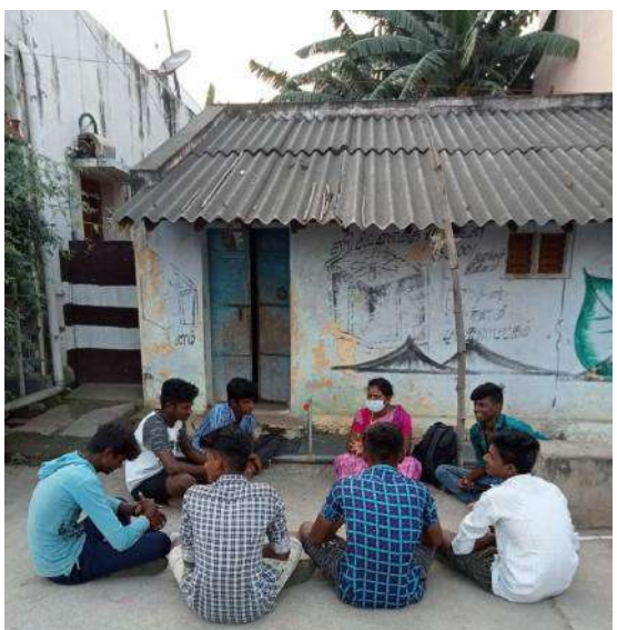
Making the Men Gender Sensible through Meetings at Village Level

The project strongly believes that the men should be sensible on gender issues. They are the population who deprive the women in all the stages of life of women by justifying gender roles and adhere to norms prescribed by the society. In order to sensitize the men on gender issues and to make them aware of that all the socio-religious norms against women are only manmade. The staff team interact with the men in the villages, organise meetings for them. The counselor and the outreach worker will facilitate the meetings. During the reporting period, sixteen gender sensitization meetings for men have been organised in which 127 men attended.