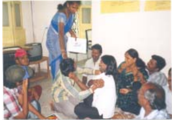
* Role Play by Peer Jeevan in the Training

Peer Education assumes greater importance in behaviour change communication. 53 Peer Jeevans (Peer Educators) have been trained and are working with their peers. They are actively involved in educating their peers, distributing condom and ensuring regular visits to the STI clinics.