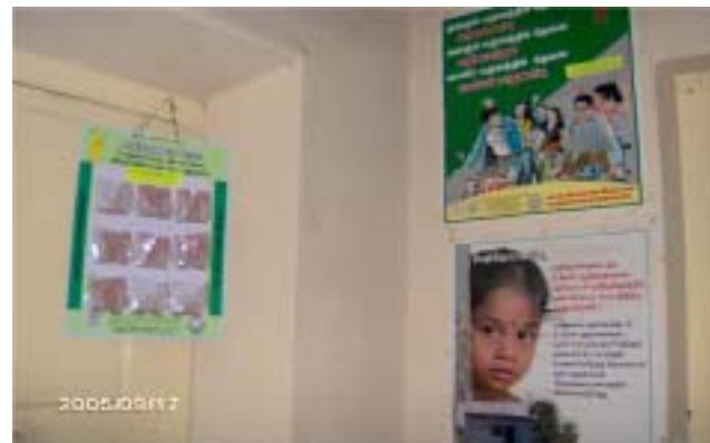
* IEC Display in Prime locations