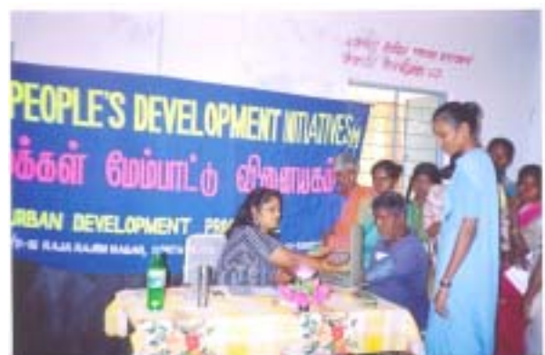
* General Health Camp in action