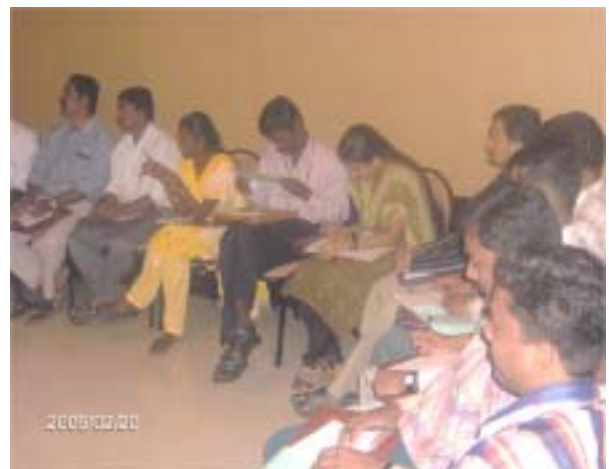
* Training in progress on "counselling skills"