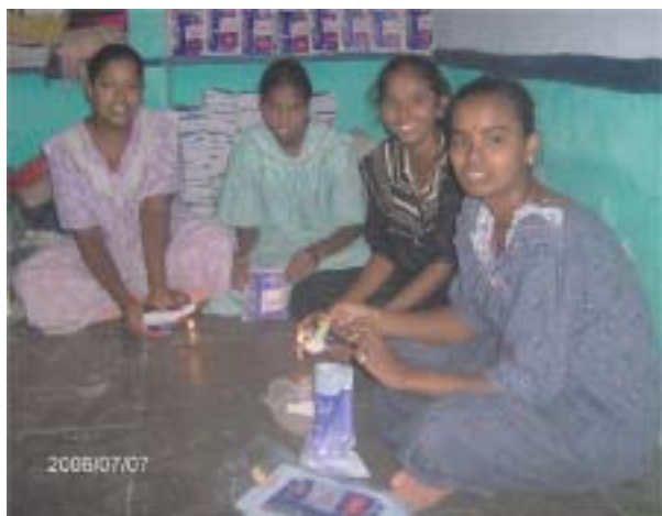
* Income Generation Programme by Young women in progress