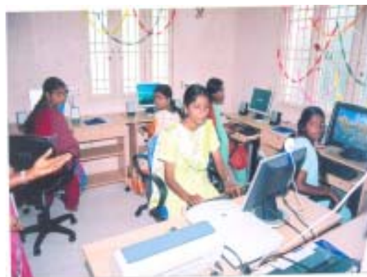
* Computer Learning Centre - Karaikal