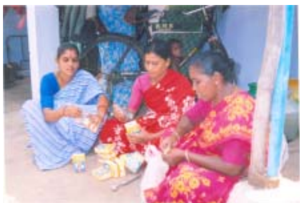
* Income Generation Programme for the women in progress