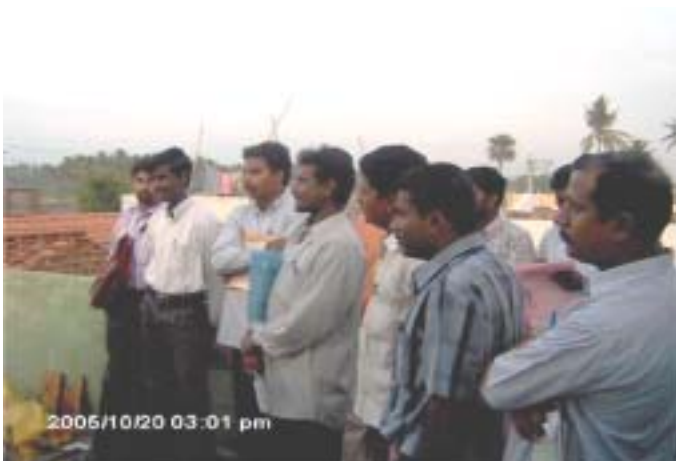
* Participants visiting the field

TAI (Tamilnadu AIDS Initiatives) has assisted PDI in organizing Training Programme on 'Counseling' to the Counselors working with the NGOs supported by TAI. First batch was started by February and twenty Counselors had attended the programme.