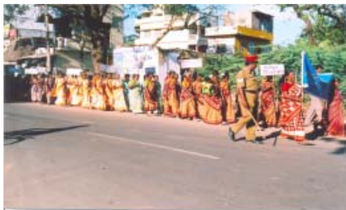
* Rally on World Women's Day