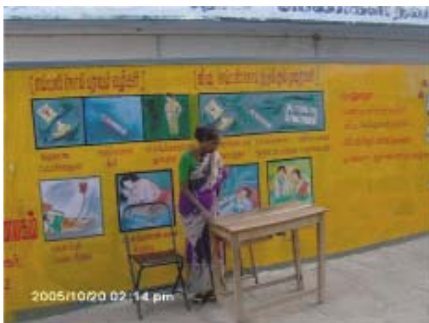
* Wall Painting in a Public Toilet Sponsored by an Youth Association

Peer education is the central point of behavior change communication