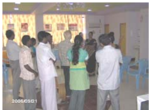
* 'Energisers' given during the sessions