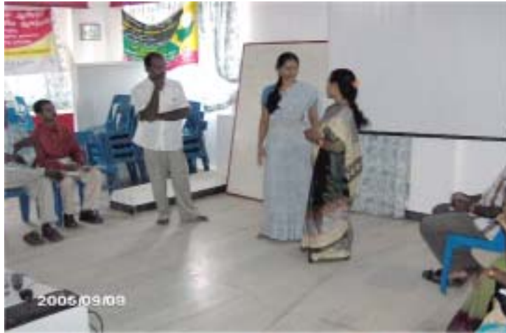
* Participants sharing their field visit experiences

period, three such Experiential Learning Programmes were organized in which, 52 staff from other NGOs had participated.