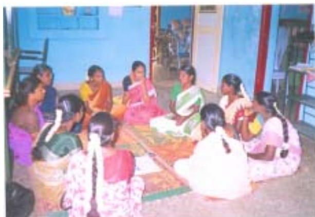
* A support Group Meeting for the woman victims.

Women Development Initiatives programme gives more emphasis on women empowerment and women from target slums involved in all the components of the project. The Self - Help Groups are being formed in all the target slums and each member gets the opportunities to avail credit from their groups, from the banks and also from the project. As on 31st March 2006, 85 SHGs were formed with the membership of 1494 women. Five groups have got linked with bank and availed a loan of Rs.1, 83,330.