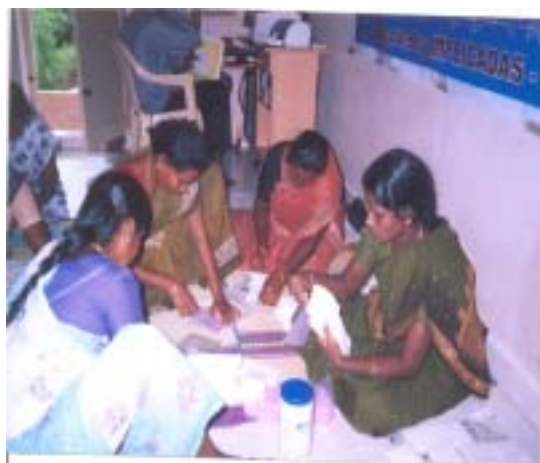
* Production Unit - Karaikkal