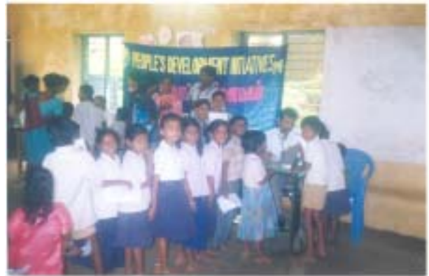
* Health Camp for the Children in Progress

The project assists the disabled persons of the target slums to avail the Government Welfare measures and they also avail loans from the project. Two special SHGs have been formed with the membership of 16.